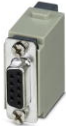
Contact insert module, Number of positions: 9, Type: D-SUB-9, Socket, Screw connection, 50 V, 1 A, 0.08 mm² ... 0.5 mm², Application: Data

Please be informed that the data shown in this PDF Document is generated from our Online Catalog. Please find the complete data in the user's documentation. Our General Terms of Use for Downloads are valid ( http://phoenixcontact.com/download )